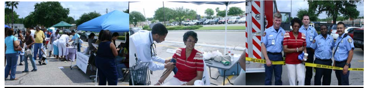
A great show of support! A Baylor College of Medicine intern checks the Constable's BP; Our Heroes from Fire Station 40 surround the Constable

Volunteering provides wonderful ways to help communities, individuals, and organizations. Precinct 7 volunteers also assist with the Senior Hotline and sometimes during special events. Please meet more of the crème de la crème of Harris County volunteers.