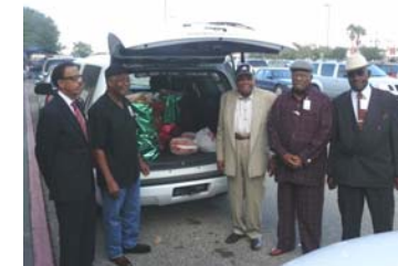
Ministers preparing to make deliveries