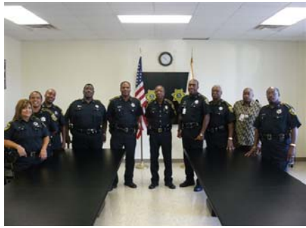
Harris County Precinct 7 Civil Division