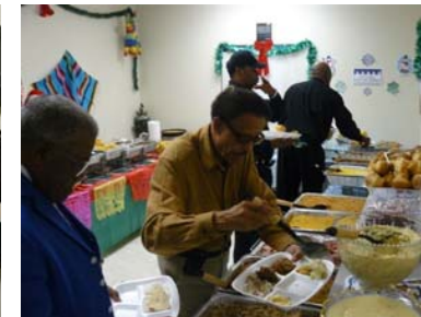
Ministers and Deputies