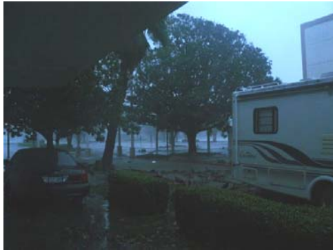
Outside the Pct. 7 building the night the storm hit

With winds gusting over a hundred miles per hour and weighing in 70 percent larger than the average hurricane, Ike delivered a one-two punch to Harris County Precinct 7. Although, the odds were stacked against the small law enforcement agency, the dedicated Constable, deputies, and staff fought back and prevailed thanks to the support of Houston citizens and local businesses.